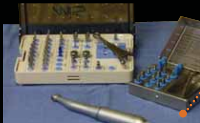
MIS implant kit MIS bone compression kit