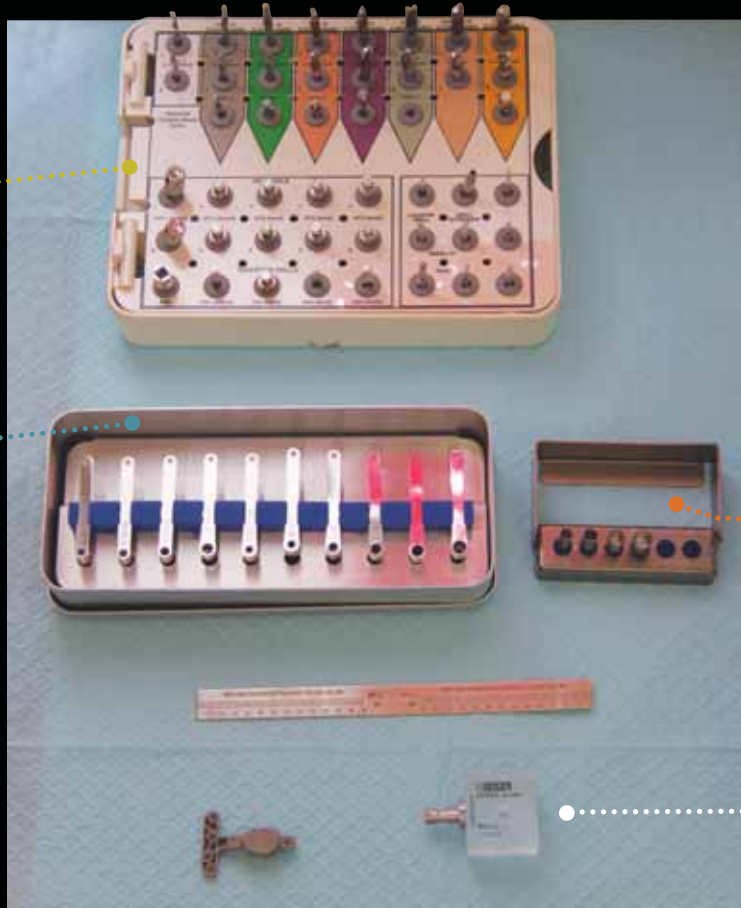
Implant Direct Complete Kit