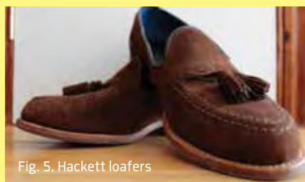
Fig. 5: Hackett loafers

This is a part of the outfit to dress up or dress down, depending on the occasion. If it's a holiday or informal meeting, a pair of smart, clean, basic trainers can provide optimal comfort with style. I often prefer travelling with a pair of lace-up derbys or brogues; however, these offer little in the comfort category. A pair of loafers (Fig. 5) wouldn't go amiss. They are perfectly