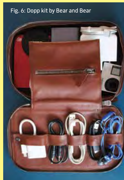
Fig. 6: Dopp kit by Bear and Bear