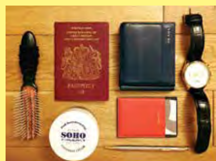
Shiraz's travel essentials