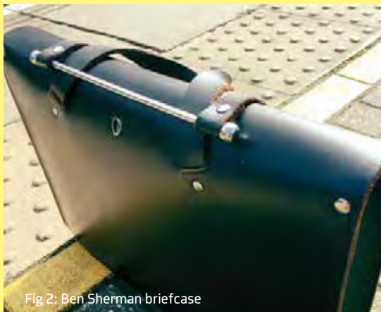
Fig 2: Ben Sherman briefcase