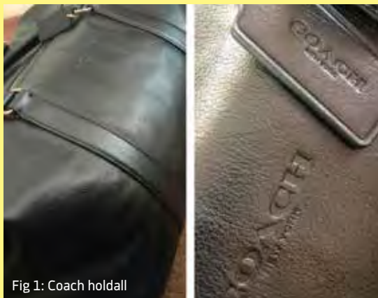
Fig 1: Coach holdall

Alternatively, if it is a short-haul flight and all you need is your laptop, then having a smooth-sleek briefcase-type luggage (Fig. 2) can be the perfect travel companion.