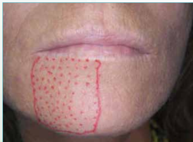
Fig. 4: Peripheral innervation of the mental nerve

From the collected data, the use of buffered anesthetic appears to enhance the speed of anesthesia onset when delivering IAN Blocks. In this study, potential extraneous factors were removed and anesthesia of the area innervated by the mental nerve was an adequate indication of IAN anesthesia. This was confirmed by the